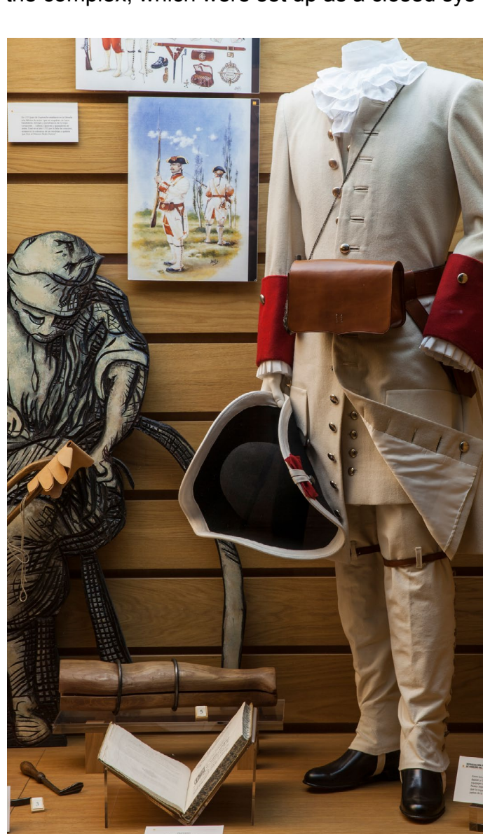
Replica of the fusilier uniform from the Lombardia Infantry Regiment, 1718.

The centre organises an annual programme of activities, which usually coincide with the local festivities of the municipality (Feasts of the Foundation, Nuevo Baztán Cultural Week, Feasts of 2 May, etc.) or with celebrations related to the centre's museum history, such as International Museum Day (18 May).