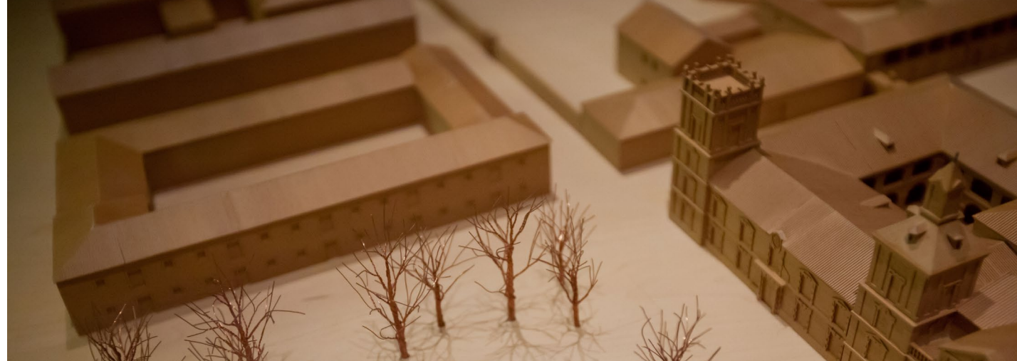
Scale model of Nuevo Baztán

The Nuevo Baztán complex was declared an artistic-historical monument in 1941, in 1980 it gained the status of artistic-historical complex, and in 2000 it became a property of cultural interest. The descendants of Juan de Goyeneche continued to own the complex until the 1980s. Since 1989 it has belonged to the Regional Government of Madrid, which has been restoring it in successive phases. The ground floor has been renovated, along with the hallways leading to the courtyard and the Plaza de Fiestas , now open to the public.