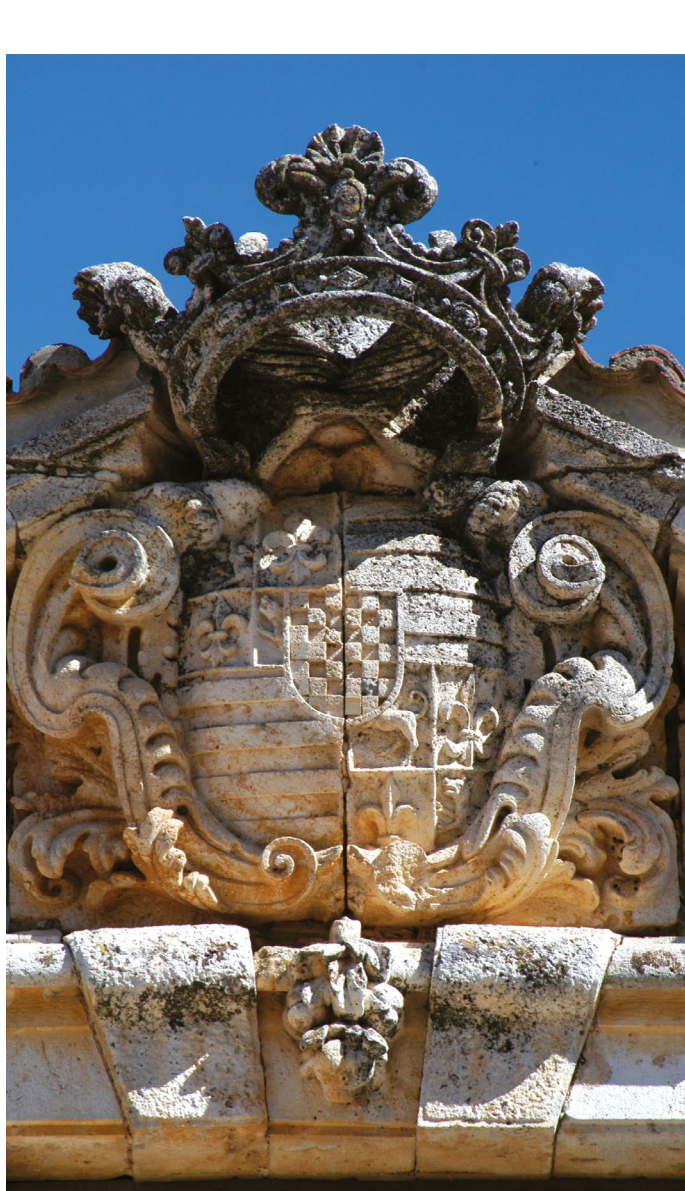
Coat of arms on the palace in Nuevo Baztán