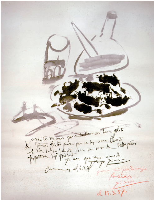
Watercolour sketch Little Fried Bulls. Pablo Picasso, 1957.