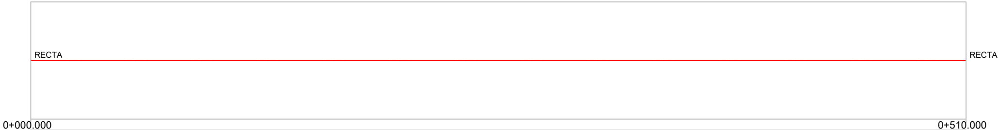
DIAGRAMA DE PERALTES